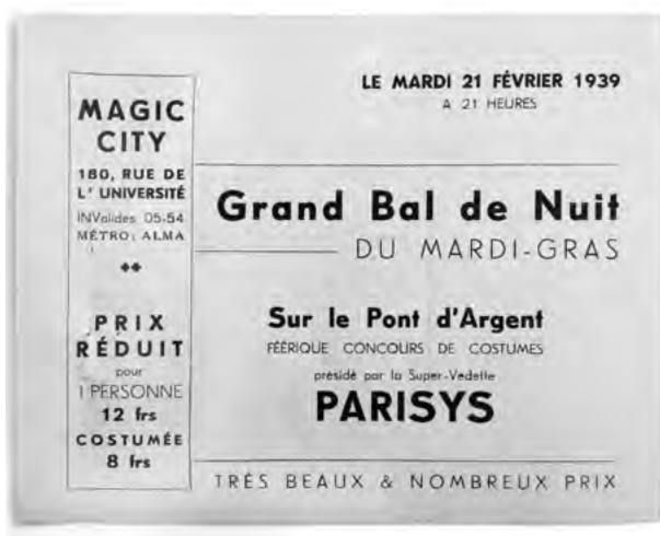
↑ Archives de la Préfecture de Police de Paris, série W, dossier n° 103119.