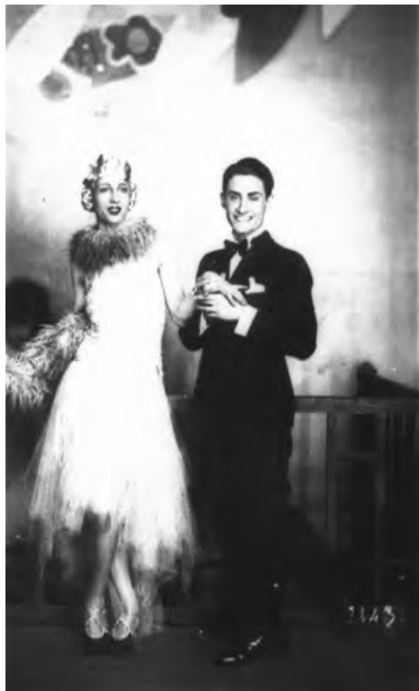
Alexandre, "The Magic-City ball. The great display of 'Décro- chez-moi ça' ('grab what you can')", Candide , 11 March 1937

The young employee distributing the tickets blushed behind the ticket counter because of the way in which these clients who, throwing their silk coats rented from a rag-and-bone shop, handed over their money in their big fist and sighed: