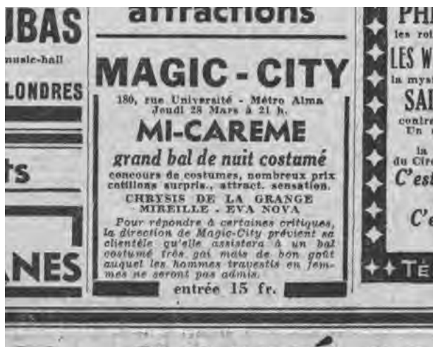
↑ Advertising insert published in Paris-Soir on 25 March 1935 (above) and in Le Petit Journal on 28 March 1935.

The transvestite ball survived, nevertheless. In 1936, 1937 and 1938, according to the short historic summary written by the police in 1939 (the document entitled ‘Notes’), it did not give rise to “any serious criticism, apart from some tidbits in a certain weekly newspaper, inspired most often, by jealous competitors”. During this period, the Brigade Mondaine seemed to have exerted strong pressure on the management of the hall, so that the ball would be as discreet as possible. We can read in a note of 23 February 1939: “In compliance with the instructions received, the management of Magic-City has been informed to give as little importance as possible to the publicity it has planned on the occasion of the Mi-Carême ball, which will be held this year on Thursday 16 March.” The ball was henceforth less dazzling, sometimes dull, nostalgic of its sparkle of the past, but still frequented by transvestites, often in smaller numbers. The Mardi-Gras ball of 1939 only hosted 300 guests. But that of Mi-Carême, which was