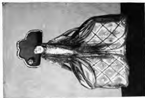
Un qui se souvient d'une Vierge de Planchet

Le chœur antique. — Mon Dieu, celle-là qui ne peut plus sentir sa dédoublure du taxi !... Eh ! préviens le costume ! (il est laid) (il est pareil) (il est pareil) (il est pareil) !... Mais celle de